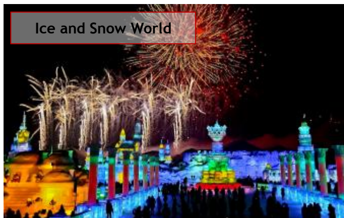
Ice and Snow World